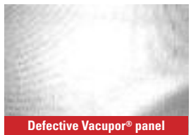
Defective Vacupor® panel